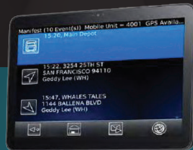
DriverMate is compatible with all Android Devices