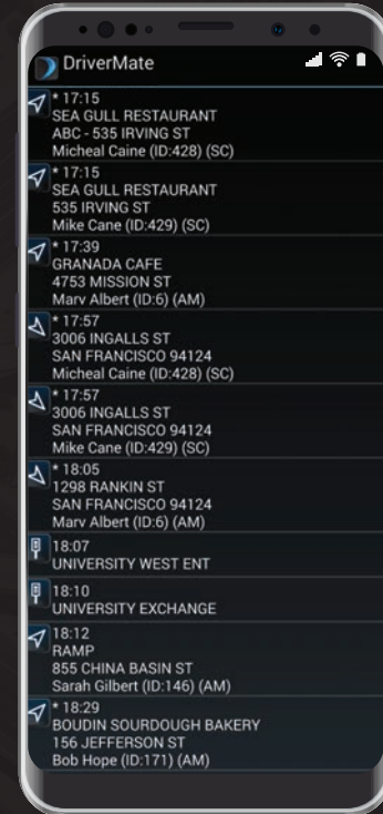
DRIVERMATE ON A SAMSUNG PHONE WITH ANDROID OS

*requires either XMM (XMobileManager) or an MDM (Mobile Device Manager)