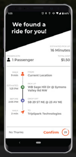
View detailed trip information