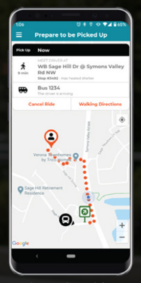
View path to pickup point and real-time vehicle location